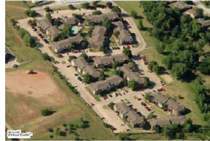
Wood Run Distribution Ratio 2 Bed/2 Bath 25%